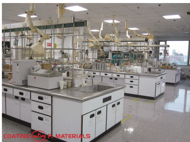
研發部門 R&D Department

材料在關鍵材料-Polyol具備自主研發及生產能力，對於後續PU與TPU產品開發上可提供最強且有力的支援，在新產品開發上更具備發展優勢，提供客戶更優質的綠色材料，讓高鼎品牌朝向「環境友善材料的代名詞」邁進。除外，高鼎精密材料也取得ISO 9001品質管理、ISO 14001環境管理及OHSAS 18001職安衛管理等認證，落實企業品質政策實施；並藉由設立會