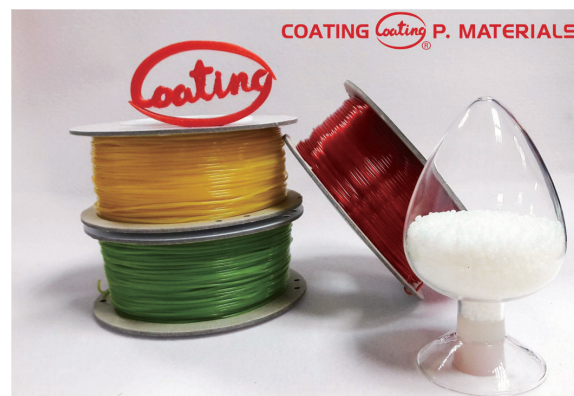
3D列印線材 3D Printing Wire Based on TPU