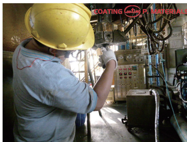
出料頭確認 Facility Confirmation