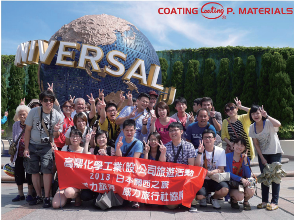
員工旅遊 Company Trip

the certification named ECO PASSPORT which was issued by TESTEX SWISS TEXTILE TESTING INSTITUTE of OEKO-TEX® Association. ECO PASSPORT confirms human-ecological optimized production and this means that there is no harmful effect on human and environmental health during the textiles production process. The content of test includes the production process, human health and waste treatment. In addition, our environment friendly materials also meet other certification requirements like REACH SVHC, RoHS, USDA, etc.