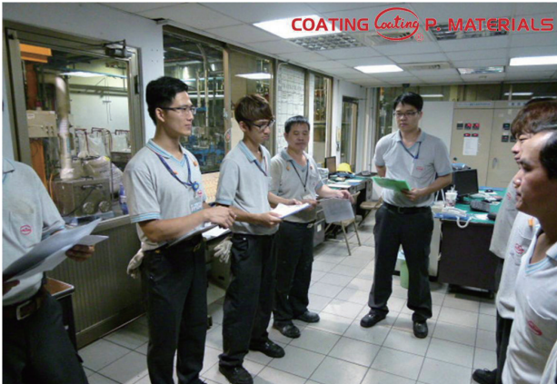
交接班會議 Conference of Shifting

計制度，與及時反應財務狀況及經營成果，以利組織決策參考，並委由專業會計師事務所進行查帳，建立帳務管理機制；高鼎也更導入內控管理系統，如ERP、BPM、CRM、PLM、BI等，建立各流程管控點以提升決策效率。