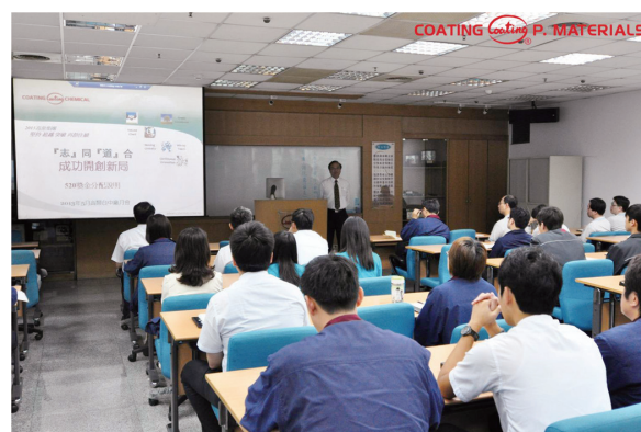
月會 Monthly Meeting

The global awareness of environmental protection has risen, and harmful substances or solvents are gradually restricted to protect our environment and human health. CPMC produce eco-friendly materials. Our solvent-free materials got