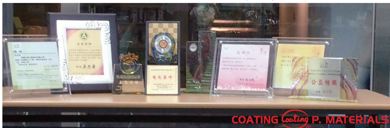
重點獎狀 Main Awards