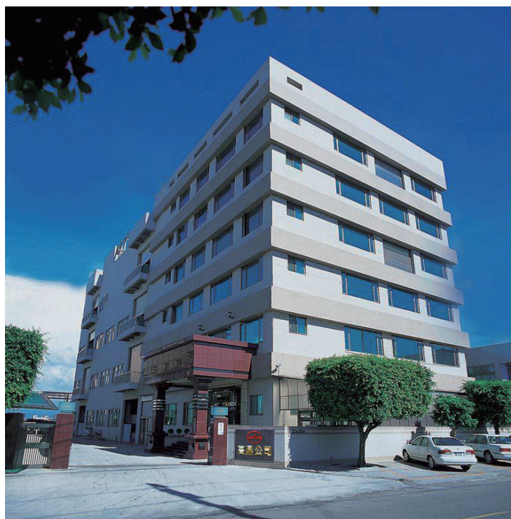
公司大門全景 Company Scene

材料在關鍵材料-Polyol具備自主研發及生產能力，對於後續PU與TPU產品開發上可提供最強且有力的支援，在新產品開發上更具備發展優勢，提供客戶更優質的綠色材料，讓高鼎品牌朝向「環境友善材料的代名詞」邁進。除外，高鼎精密材料也取得ISO 9001品質管理、ISO 14001環境管理及OHSAS 18001職安衛管理等認證，落實企業品質政策實施；並藉由設立會