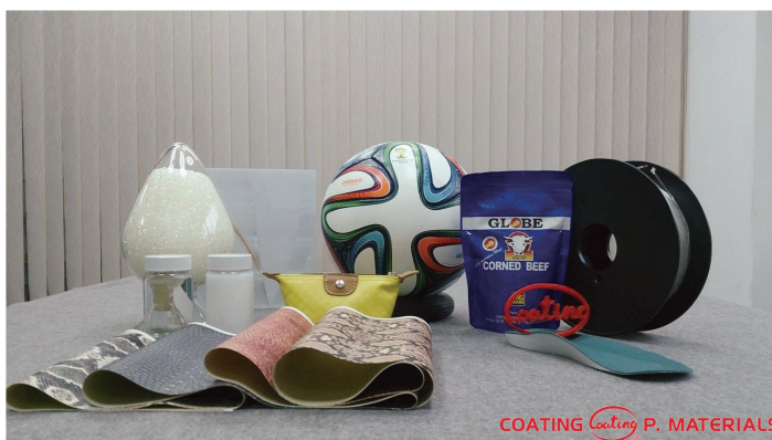
全系列產品 All Series of Products