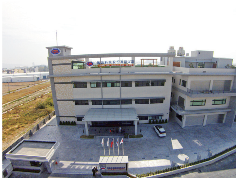
公司全景Overall View of Company

出身於傳統農業世家，待人務實的顏董事長以秉持「不怕慢只怕站、借力使力及化阻力為助力」為自己身體力行的圭臬。廣美科技創立初期不順遂，雖已在汽車專業領域涉略多年，但卻屢遭挫敗，僅僅6個月時間，就耗盡公司近70%資金，讓剛起步的廣美科技，就面臨重大危機。歷經虧損及技術瓶頸，爾後在處理