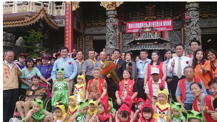
慈善公益活動 Charitable and Public Welfare Activities

QMTC believe ‘people’ are the key factor to