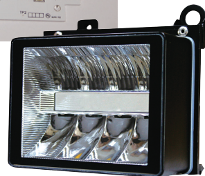
代表作之一：高鐵頭燈 One of the Masterpieces : Taiwan High Speed Rail Headlight