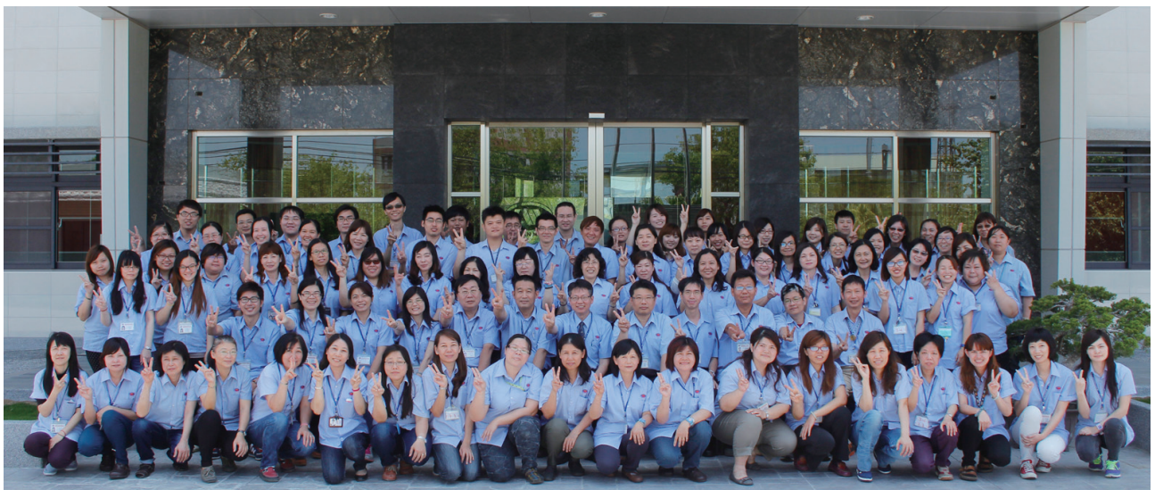
員工全體照 Photo of Employees

廣美科技善盡企業的社會責任，積極參與各項社會公益活動，且定期資助當地相關慈善教育機關團體及公益團體，如：低收入戶獎助學金、協助辦理青少年課後學習課程及贊助華山基金會到宅愛心車，提供關懷訪視年長者等相關公益活動，樹立良好企業之風範，提升企業整體形象。■