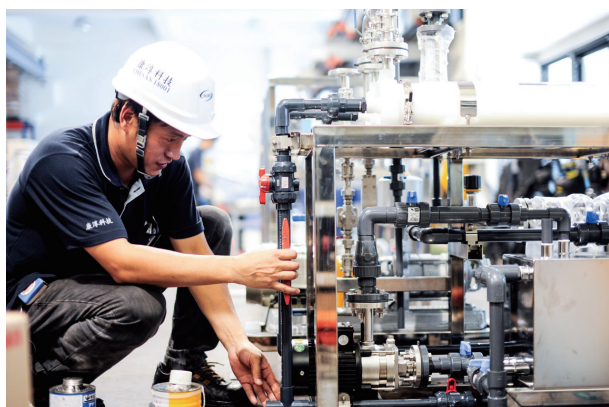
機台組裝 Production Line

康淳科技在水處理工程產業之競爭優勢為從設計、製造、施工到維修服務皆有能力自行處理。總公司位於台中精密機械園區，擁有寬敞之設備組裝工廠，因此可穩定控制品質、可縮短交期，降低生產成本。另每套系統所需之自動控制程式設計、電控盤組裝配線等，皆由公司員工負責，可將控制邏輯標準化，縮短異常排除時所需之查修時間，亦可掌握關鍵技