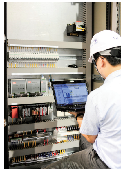
電控配盤 Production Line

國內外旅遊，免費提供員工午餐、加班晚餐、北中南員工宿舍、支付全體員工手機費用、成立各類活動社團、每年健康檢查等，更於2014