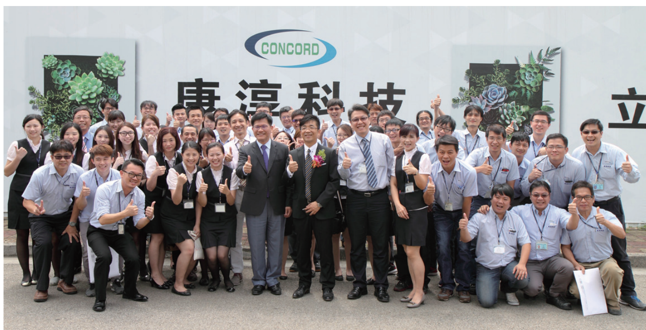
林佳龍市長親臨員工住宅動土典禮 Mayor of Taichung City Lin, Chia-Lung Attended the Employee Houseing Groundbreaking Ceremony

CTC strategizes to be a turnkey solution provider from design, manufacturing, installation as well as providing high quality after services which bring the company to be more competitive in water treatment industry. Headquarters is located in The Taichung City Precision Machinery Innovation Technology Park with a spacious space and equipped with advanced tools for quick assembling, production cost control and product quality. All the automation control systems and programming are designed and assembled in house. Standardized control logic shortens troubleshooting time and keeps