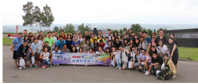
國外旅遊-北海道 Company Trip - Hokkaido

CTC hopes to achieve high customer satisfaction level, and also be able to provide heart-touched service for customers. Therefore, CTC is offering good benefits to employees. In addition to three Chinese festival bonuses every year, in every September, the company gives an extra semi - annual bonus based on the operating conditions of the first half of fiscal year. CTC provides certain percentage of stock dividend from retained earnings for employees. Other benefits include domestic and foreign tours, free lunch, overtime meal, staff quarters, paying employees' mobile phones bills, clubs, thousands of books and DVD movies to borrow for free, and providing all employees with additional health insurance, accident insurance, health checks every year and so on. In 2014, CTC purchased 981.82m 2 of land with four enterprises in neighboring location at Wen-Shan road to build the employee housing. This employee housing is expected to be completed in