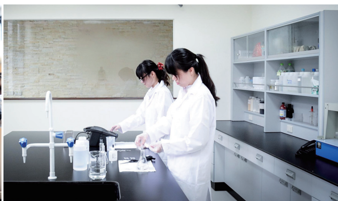
水質分析實驗室 Water Quality Analysis Laboratory