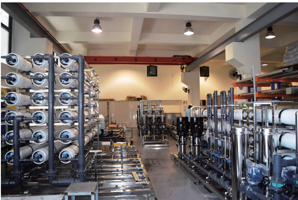
生產線作業 Work Situation

際市場，透過標準化、模組化，讓產品於台灣生產、製造，再行銷國際。康淳科技透過不斷的創新、穩定成長、持續獲利，讓企業永續經營，讓員工以康淳為榮。■