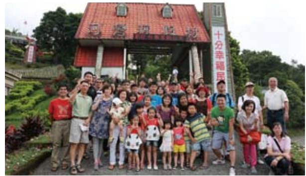
平溪員工旅遊 Pingxi Trip

productivity. Therefore, every year, Jufan tries very hard to increase employee salary and benefit and to offer scholarship for employee children and emergency allowances for local community. By doing so, Jufan wishes to gain the reputation of “happiness enterprise” and to be a perpetual business forever.