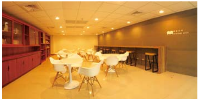
員工圖書室 Reading Area

亮麗的營運績效來自員工分秒的貢獻與努力。君帆為落實照顧員工，及讓其子女受到更好的教育與生活，除提供穩定的工作環境外，每年調高薪資、發放獎金與紅利，更固定提撥盈餘作為員工子女獎學金，提振員工士氣，以達到良好的工作績效，促使全體員工與公司同舟共濟共同奮鬥，讓公司成為台灣的幸福企業，並永續經營成長。■