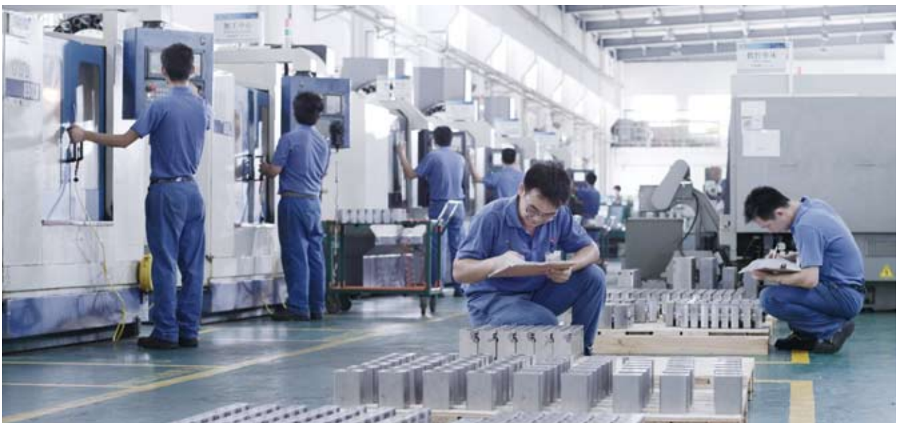
生產線 Production Line