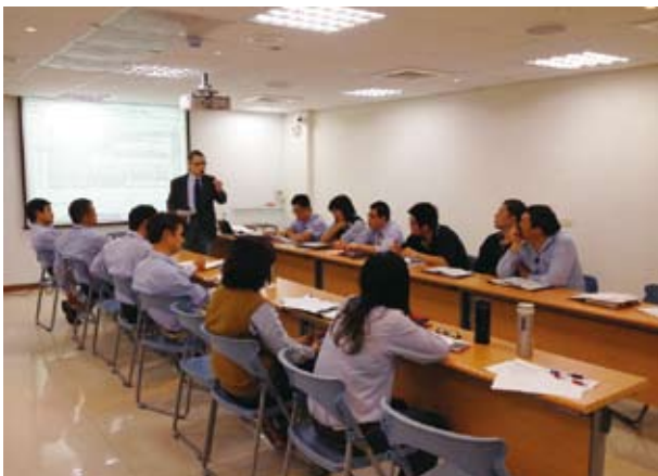
KPI會議 KPI Meeting

君帆為精密機械關鍵零組件產業的尖兵，為累積專業技術，積極透過教育訓練，厚植員工流體傳動與控制技術，成為公司核心專業技術競爭力。此外，依據產業客戶多樣少量的需求特性，自行開發一套接單生產客製排程的網路即時經營管理系統(ERP)，動態執行業務、資材、品保等功能管制流程，滿足客戶穩定品質與彈性交期要求，成為公司核心管理技術競爭力。以此兩大核心技術競爭力為後盾，不斷貼近市場需求，隨時為客戶解決問題，是君帆