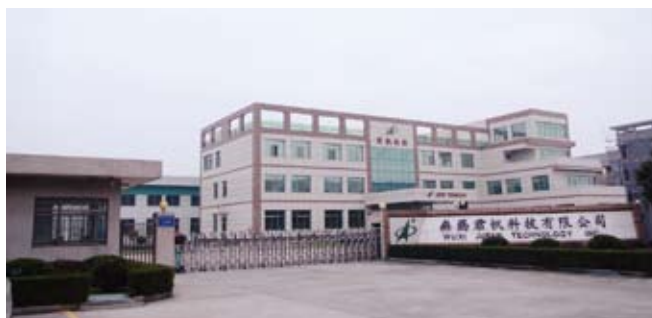
中國無錫廠 Wuxi Plant