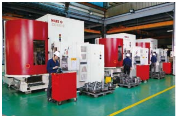
生產線作業情形 Production Line

Breakthrough is doing something one could not. When we encounter any difficulty or challenge, we rely on our strong faith and hope to go through them, creating differentiation and additional values of products with innovation, and continuously enhancing on every detail with our humbleness and gentleness, we rely on God and confident to strengthen our solid enterprise foundations and explore the bright future.