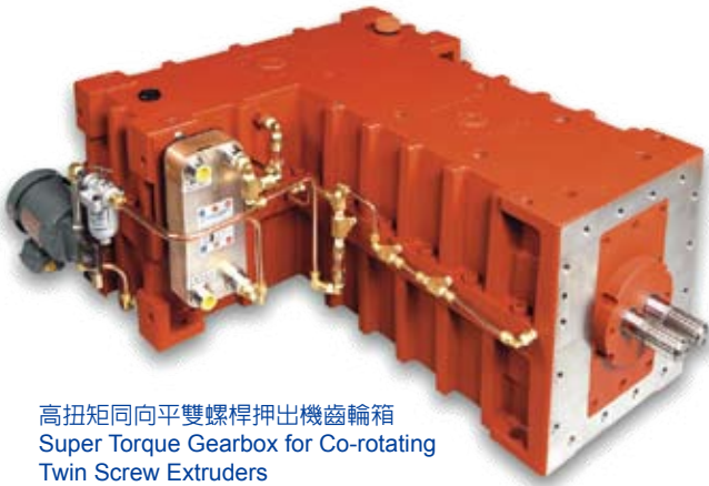
高扭矩同向平雙螺桿挤出機齒輪箱 Super Torque Gearbox for Co-rotating Twin Screw Extruders

The pursuit of quality, make the service more valuable; Intentions of work, achieve the dream of sustainable management. Sun Lung insist of striving for pragmatic and excellence attitude. Over the past 50 years, Sun Lung successfully transformed from a traditional processing manufacturer into creative research and development brand company. We have focused in the making of core gear parts and the development of new technology, we integrated our technology to create our own brand name, expend the factory, new product patens, and global marketing network. We have successfully market the Sun Lung brand throughout more than 30 countries worldwide. Sun Lung is a company proud to be rooted in Taiwan, but prospect the world. Our goal is to achieved global key components market, and allow us to turn this beautiful earth using our gearboxes with customers.