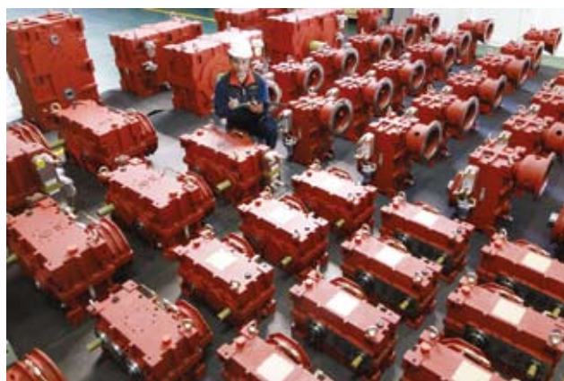
齒輪箱品質檢驗 Gearbox QC Inspection

三隆齒輪五十四年來專注於齒輪加工技術及塑膠機械齒輪箱之研發與製造，透過市場需求調查與客戶回饋機制，針對產品進行持續改