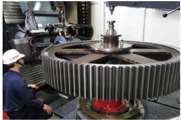
大型精密齒輪加工 Precision Gears Machining

秉持飲水思源、回饋社會的經營理念，三隆的社會責任分別從弱勢團體關懷、生態環保、產業人才培育、多所學校獎助學金等多方面著手，藉由企業與社會多方團體的資源共享及交流，為弱勢團體提供一可運用的資源平台，更為台灣機械產業界人才的新生與養