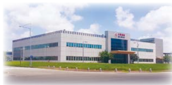
公司全景 Company Overview