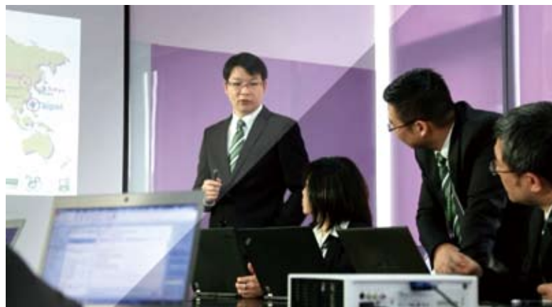
經營團隊會議 Executive Team Meeting