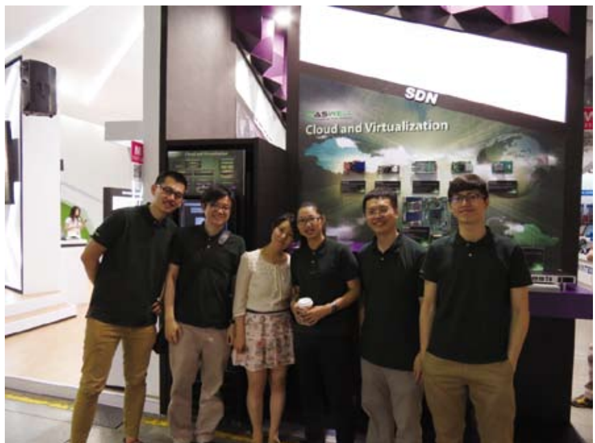
2014 Computex展 2014 Computex Exhibition

Caswell's marvelous performance in sales has to be attributed to its focus on technological innovations. Developing cloud computing platforms, advancing network security technologies, and optimizing Teleco equipment (e.g. ATCA) have been the focal points for its products and services. It is believed the development of the above three are the best solution to improve human's digital life and key to provide accurate, safe and high-speed services. Besides, online knowledge and content shared on community websites will become far more enriched. Being a one-of-a-kind network server supplier requires in-depth understanding of each customer's unique need in system specifications for specific industry. Thus, Caswell always establishes close relationship with its business partners and now is able to provide a complete range of services that include consultancy, product, design, manufacture, and distribution. These years, Caswell has devoted herself to the development and manufacturing of network security appliances. To ensure the quality of its products and working environment, Caswell not only has discreetly enacted the procedures for R&D, verification test, production, distribution and RMA but has also acquired a series of quality management certificates (ISO-9001,