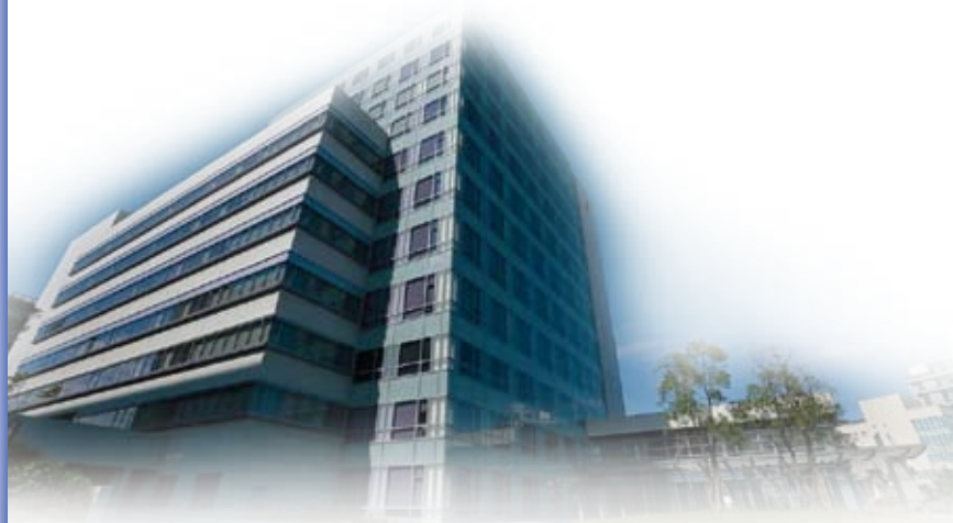
瑞祺研製中心 CASwell Office Building