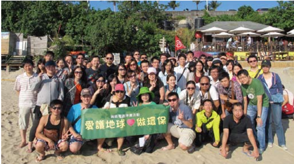
2013員工兩日遊及淨灘 2 Days Staff Local Tour in 2013

ISO-14001, OHSAS18001, and TL9000). With so many efforts made, Caswell has gained long-term trust from customers and created steady growth in revenue.