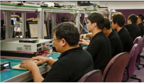
整合測試團隊 System Integrated Testing Workforce

Foreseeing the booming potential of digital content and storage management, 6 software engineers with shared ambition established SnH Technologies, Inc. in April, 2007, and the development of Linux kernel technologies and network storage applications were the core focuses. In 2008, to further enhance the R&D capabilities and sales of server and network security appliances, SnH Technologies was amalgamated with the Communication Appliances Service BU in Portwell Group and renamed as Caswell, Inc. With Caswell's state-of-the-art technologies and well-rounded services, the vision of making our lives boundless now is not a farfetched corporate dream anymore.