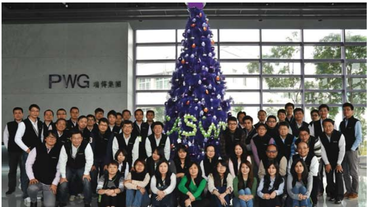
2014年度KOM團照 2014 Kick Off Meeting Team Picture