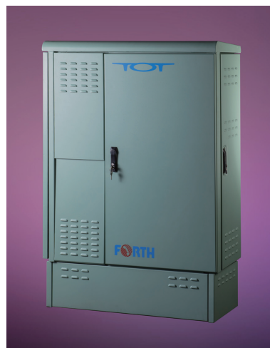
光纖通訊系統櫃 Optical Fiber Communication System Cabine