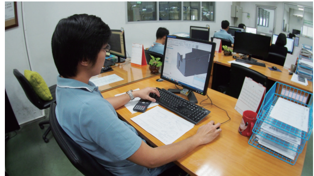
研發 Research & Development Department

變化，持續拓展高利基市場，並進入高技術度、高精密度及高複合加工之航太產業、醫療產業。在產業鏈中，經寶精密位居中心廠之供應商角色，屬B2B之商業模式，雙方之關係應為信任承諾、分享互動之無形鏈相互連結。經寶精密以洞察環境變化，掌握客戶需求，創造客戶滿足，持續競爭優勢。■