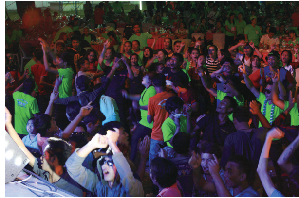
晚會 Evening Party

Jinpao will continue to be adaptive to the