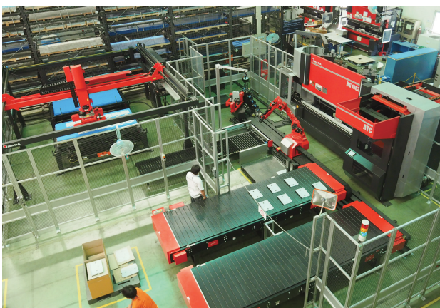
自動倉儲送料, 機械手臂折彎 Factory Scene

Jinpao is actively engaged in CSR activities as well. As a company based in Thailand, the