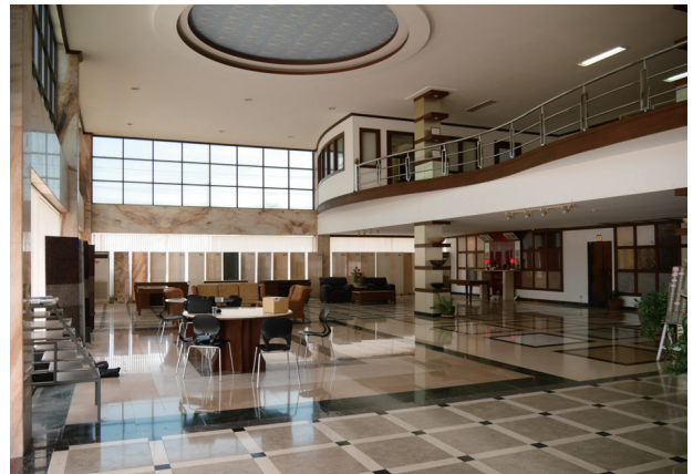
辦公室內部 Office Show Room

初期主要是從土耳其進口原石，依顧客需求切割成品。2010年與國際知名香格里拉飯店合作，為企業帶來後續許多商機，豐鼎石材秉