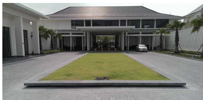
工程案例 Project Reference