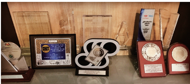
卓越事蹟 Outstanding Deeds

Dufu has 800 employees in Malaysia, 400 employees in Guangzhou and 10 employees in Singapore. Dufu