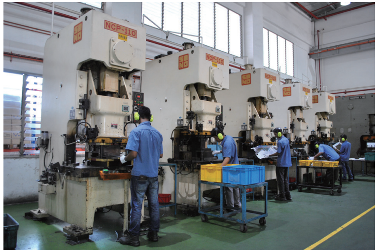
生產線 Production Line

Dufu Technology main products are high precision machined components for Hard Disk assembly. The company is dexterous in manufacturing of high volume, high precision and high quality products.