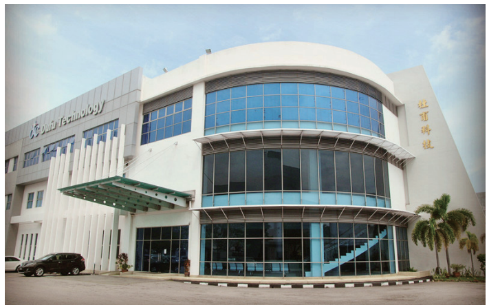
公司大門全景 The Overview of the Company

除了感謝客戶長期以來的支持，更感謝所有員工的努力付出。展望未來，杜甫科技希望在創造利潤分享投資大眾之餘，更要堅持對顧客的承諾，不斷提升技術開發，提供一流品質的產品，準時的送達顧客處，持續獲得客戶長期信賴的保證。■