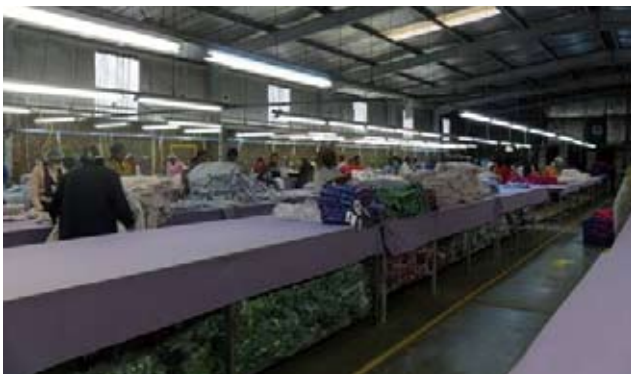
包裝部門 Packaging Area

從1999年公司成立至今，轉眼間就到了第15年，製作成衣不外乎就是品質第一，交期準時，所以對員工的管理要求也非常嚴格，總是想要把最好的一面承上給顧客，鼓勵員工保持良好的素質和成衣品質，才可以得到最大的經濟效益。