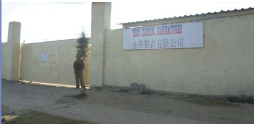
工廠大門 Factory Gate