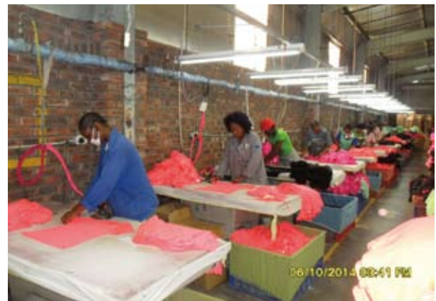
整燙部門 Finishing Area

董事長一直堅信「只要有心，肯努力，沒有什麼是做不到的」這是他一路走來的心聲，也是最常和員工說的一句話，雖然辛苦，但就是每個人都肯齊心努力，我們才可以順利的走過這每一年，董事長說，「在這裡真的非常感謝和我一起奮鬥的每一個人」，希望這份願可以創造最大的力，讓公司更茁壯成長。 ■