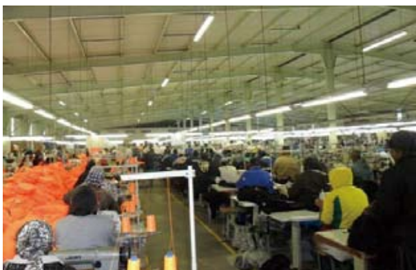
車縫部門 Sewing Area