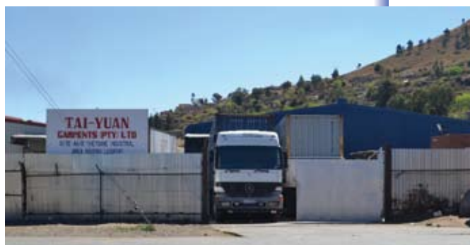
大門 Main Entrance

POLO, Active wear Tops and Pants, Ladies suits, Jacket, T-Shirt, Warm wear