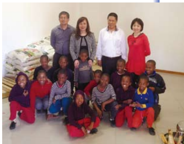
孤兒院發送 Orphanage Supporting with Food and Basic Supply