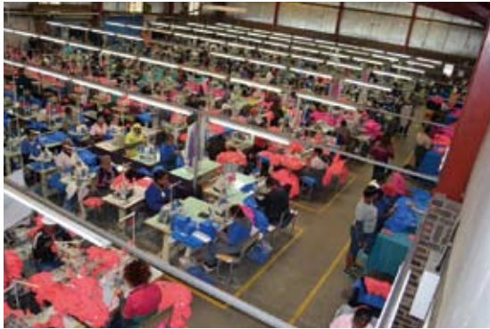
車縫部 Sewing Department

it, then do your best, otherwise don't do it at all". This is what she often tell her employee, Garment business is very complicated, to make one garment there is many steps and procedures, and to live up to buyers expectations, ever step is important, and quality control is very crucial. She often heard friends saying textile business is a sunset business, but she thinks that there is only sunset Management, and not sunset business. For a business to grow well, all her employees need to work together as a team.