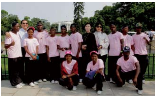
ACC非洲孤兒造訪白宮 ACC Orphans from Africa visited White House