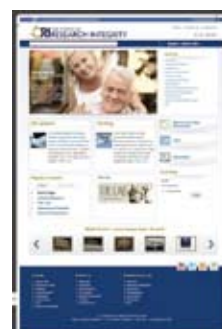
產品 HHS ORI Website