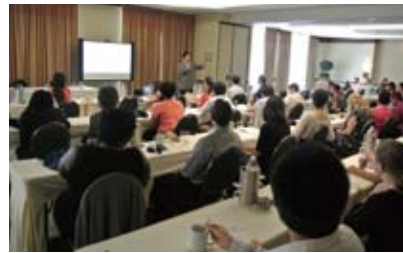
會議討論 DSFederal "Lunch and Learn" meeting

鼎世聯邦顧問公司的願景在於堅持以高規格的企業品質，在以下領域中提供最優質的服務：