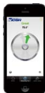
產品 NIOSH Ladder Safety