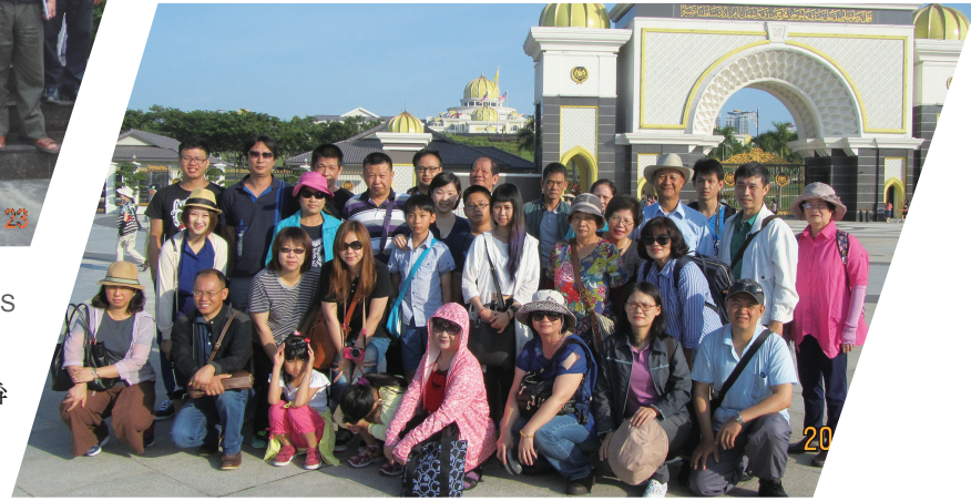
公司旅遊 Company incentive tour

化的路線；其中，軟實力亦是企業增加競爭力的關鍵因素，透過產學合作進行產品性能試驗，提供有效的實驗數據，證明金屬擴張網品質與實用性。此項措施提升了上鎧金屬擴張網競爭力，並為客戶提供更專業、詳盡的解說，進一步達到互信的溝通模式，讓公司與客戶達到雙贏、互利的局面。