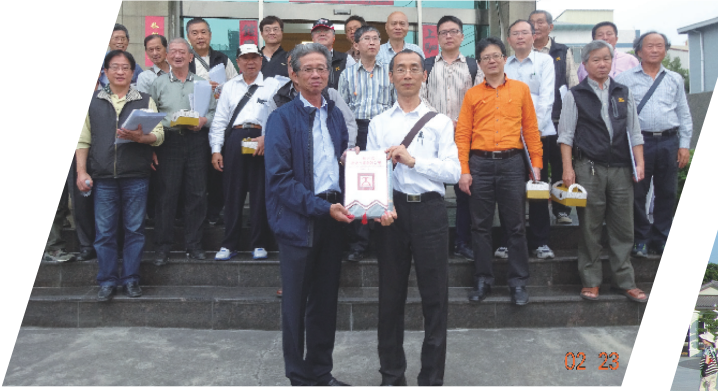
高雄市建築師公會參訪 Kaohsiung architects association visited SKS