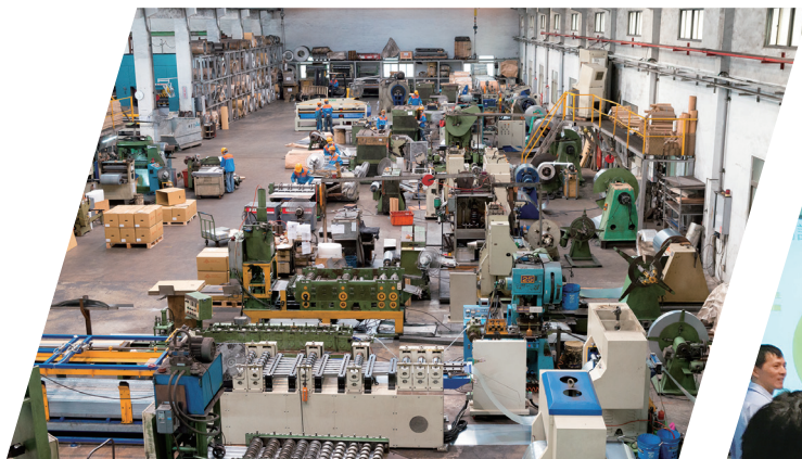
生產線 Production line