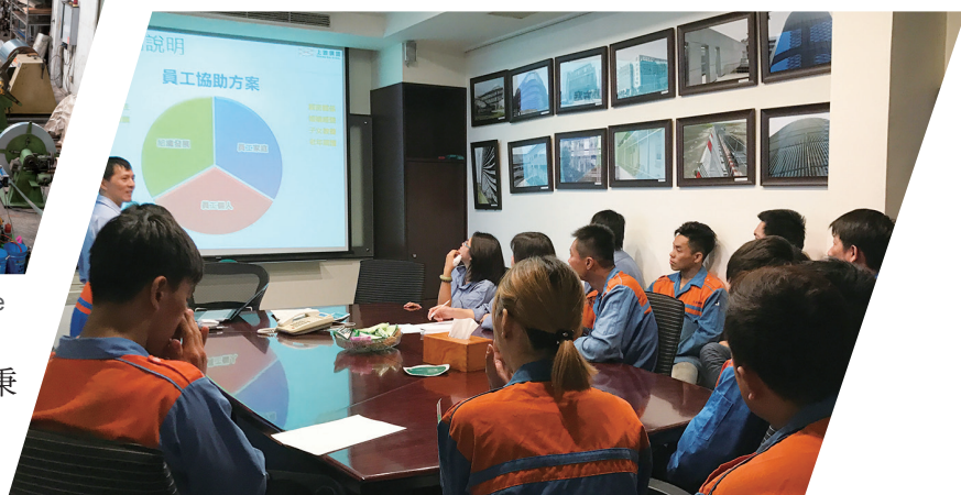
員工教育訓練 Employee training

上鎧鋼鐵係由董事長林宗志先生，秉持著「誠信」與「品質」為本的信念，於1988年一手創立，至今亦已續證通過品質管理系統認證ISO 9001。上鎧雖為擴張網產業的後者，但靠著不斷地自我要求進步與創新，今日已成為我國產業用金屬擴張網（Expanded Metal Mesh）產品業界之龍頭。30年來，透過跨國合作導入新技術，加上內部軟硬體皆持續地汰舊換新，讓產品多樣與質量兼備，除國內市佔率超過60%外，更外銷出口至香港、澳洲、日本、美國、新加坡、印度、歐洲、阿拉伯、紐西蘭及巴拿馬等地區，至今全球大大小小客戶已超過1千家並獲得客戶們的一致肯定，儼然成為當今臺灣傳統產業的典範與驕傲。