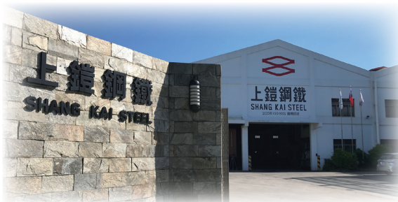
公司大門入口 SHANG KAI STEEL Entrance