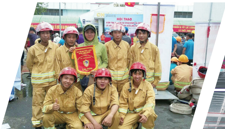
員工教育訓練 Status of education and training of employee