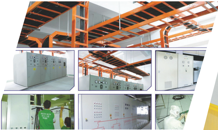
輸配電工程施工作 Transmission and distribution project construction

日科技未來將朝多角化經營為主軸，運用公司豐沛資金，投資有未來性之企業，並利用資源協助其攻進市場，積極佈局新興事業範疇，以贏得發展先機與優勢。