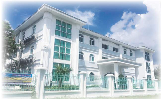
辦公室全景 Company office overview