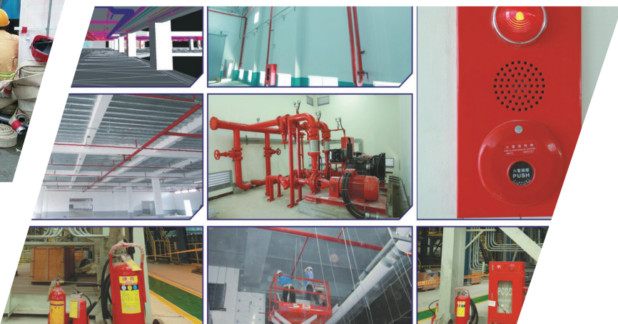
消防管路及偵測工程施作 Firemain system and engineering construction

佳日科技成立於2004年，以精進本業、滿足客戶需求的指導原則，藉由行銷策略規劃及多樣化的行銷通路，加上營建等各類人材的招募與培訓，讓佳日科技更趨多元化的經營，至今已構建完成各類廠房，從營建、強電、弱電、消防等工程，一條龍建造能量。