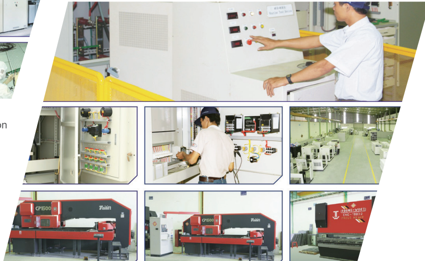
自動化配電盤生產線 Automatic distribution panel production line

理人才招募說明會，延攬優秀華人子弟至公司任職，並提供相關教育訓練，培訓成為可獨當一面管理幹部，現在公司即有一批優秀中階管理幹部（如電盤廠副廠長等），即循此一管道系統培訓而來。