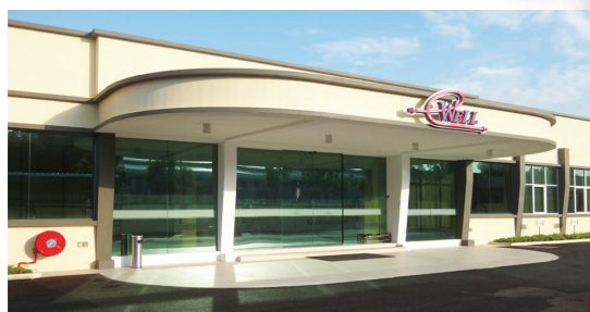
公司大門全景 Office entrance