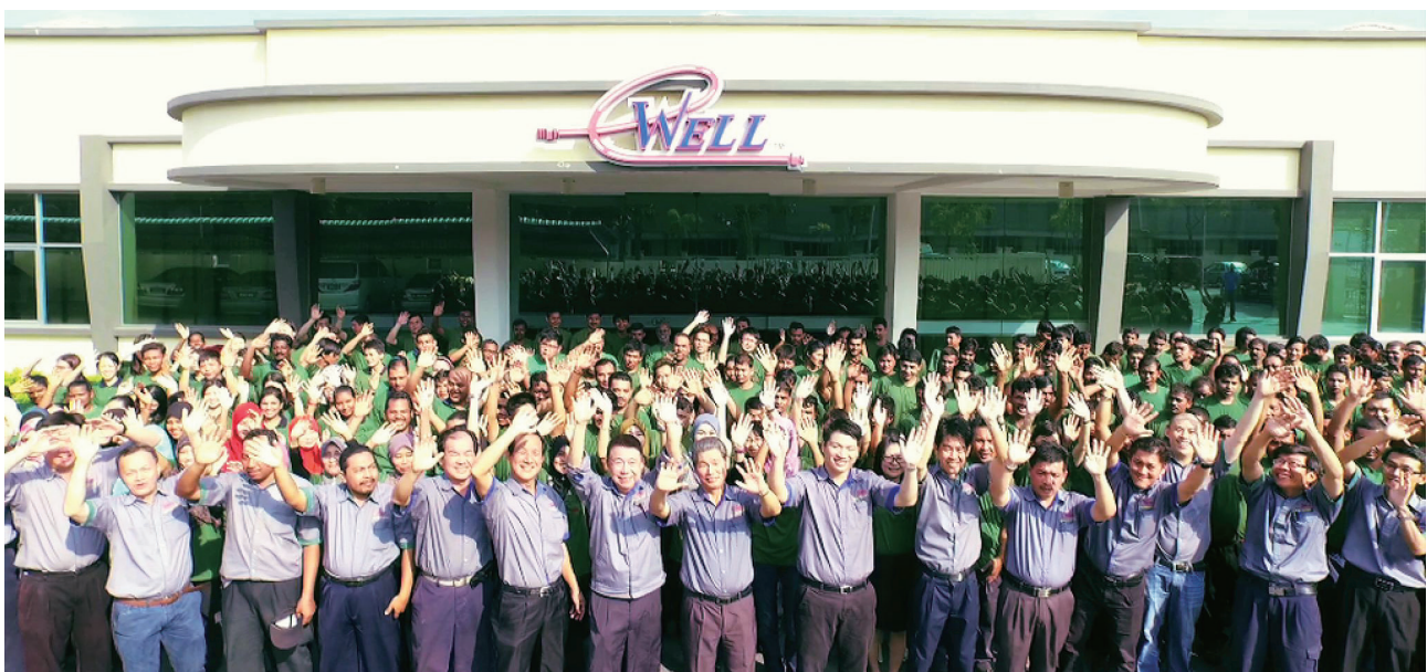
公司員工團體照 Company group Photo

There are various kinds of products from Wellcall, and the R&D department invests a large amount of professional research personnel and testing equipment in building a large formulation database in order to improve technology. The R&D department also develops larger size products and repeatedly tests and improves the heat resistance of hoses in order to meet high-end product demands. In recent years, Wellcall has persistently expanded and improved plant efficiencies to overcome challenges from local and global competitors. Nevertheless, Wellcall maintains its strong position and presence in the industrial rubber hose arena.