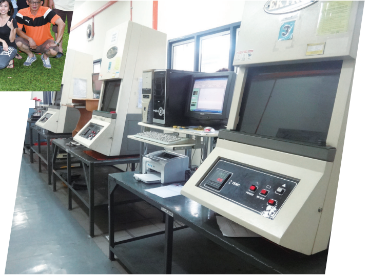
研發部門 R.D. department

黃董事長常以「做人要誠實、做事要誠信、待人要誠心」的座右銘鼓勵員工。每次與客戶交手，就是一次交心，緯鉅的戰役已不在於贏得市佔率，而是贏取「心」佔率，贏得客戶的心。