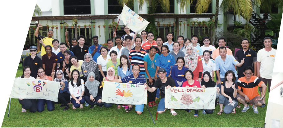
教育訓練 Employee training

緯鉅膠管創立於1995年，領先業者開創多類別工業用途橡膠軟管的專業製造服務模式。在馬來西亞橡膠業居於領導地位，為規模最大、年產數量最多的膠管企業。緯鉅膠管不受貿易商箝制，將銷售通路掌握在自己手中，積極開發市場，並架設網站主動尋找客源，目前擁有250個客戶遍佈全球60多國家。累積的經驗與良好商譽，使緯鉅膠管於2003年獲得ISO 產品設計與開發認證，以及獨立第三方機構對產品質量的保證。