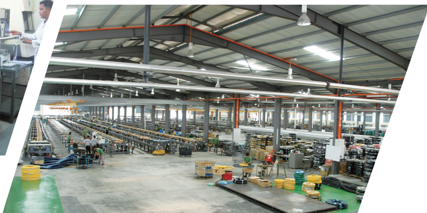
生產線 Production line