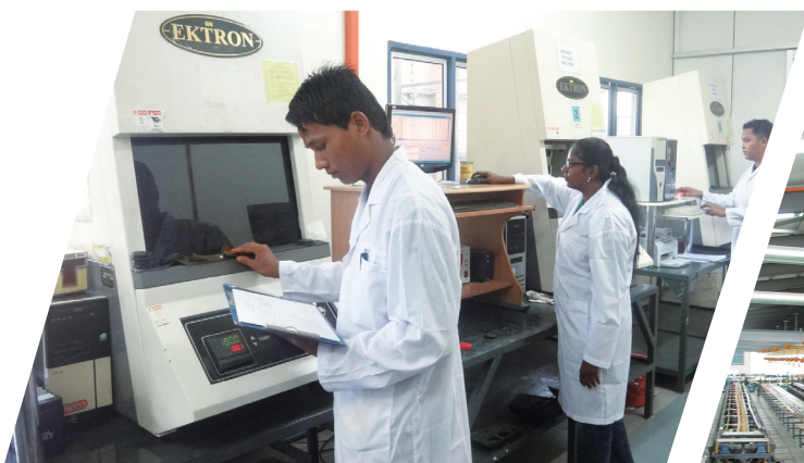
研發部門 R.D. department