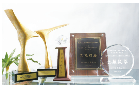
2005年 海外華人第十四屆創業楷模獎 14th Overseas Entrepreneurs Award of year 2005