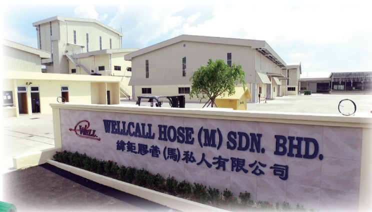
工廠大門全景 Factory entrance