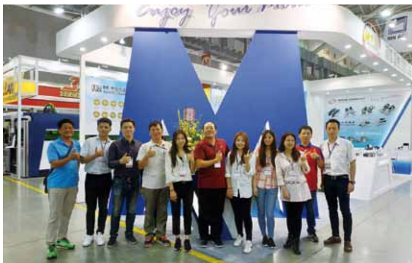
● 2018台北國際自動化工業展覽 (2018 Taipei Int'l Industrial Automation Exhibition)

碩陽為專業直流有刷及無刷馬達製造廠，從事於精密馬達、醫療用馬達、電動輪椅及電動代步車馬達、傳動系統設計及製造。自2002年成立即以自有品牌Motion Tech. Motor行銷世界，深耕於電動代步車、電動輪椅傳動系統，已頗具國際知名度。碩陽與國內其他中小企業無異，皆發跡於微小人力物力，在資源有限的情況下，以優異產品線及具國際競爭力的產品成功行銷世界逾40多國，外銷比例超過60%且逐年拓展成長中。