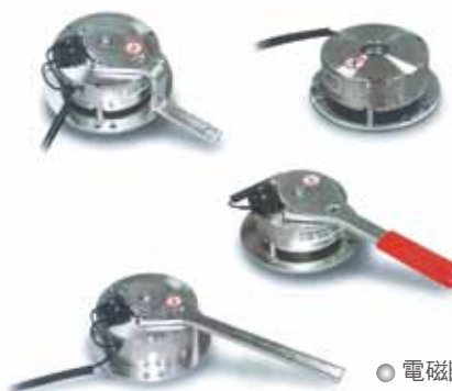
● 電磁斷電煞車(EMB series)

Products : Motor ,Brushless Motor ,Gearbox , Gearbox-Motor , Transaxle-Motor , Driver