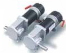
● 減速馬達(EC series)