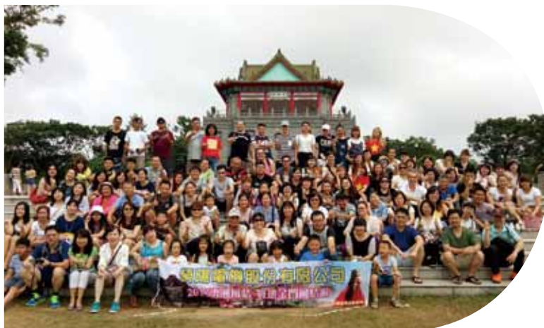
● 2017年員工旅遊（金門三日遊） 2017 employee tour (Kinmen 3-Day Tour)

Motion Technology Electric & Machinery Co., Ltd. is a professional DC brush and brushless motor manufacturer specialized in precision motors, medical motors, electric wheelchairs, electric scooter motors, and transmissions system design and manufacturing. The Company has its own brand Motion Tech in 2002 and began to engage in worldwide marketing. Through its long-term deep plowing of electric scooters and electric wheelchair transmission systems, Motion Tech has gained considerable international visibility. Motion Tech started with minimum manpower and logistics like the rest of our domestic SMEs. With limited resources, it has successfully marketed its products in more than 40 countries through its excellent new production lines and internationally competitive products, with an export ratio exceeding 60% and increasing year after year.