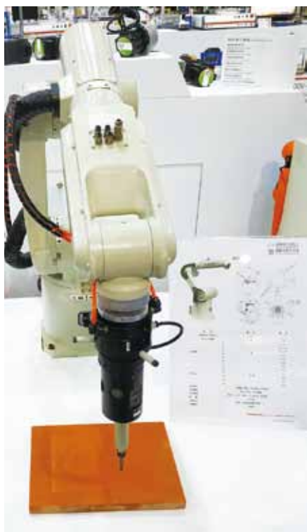
● 2018台北國際自動化工業展覽 (2018 Taipei Int'l Industrial Automation Exhibition)