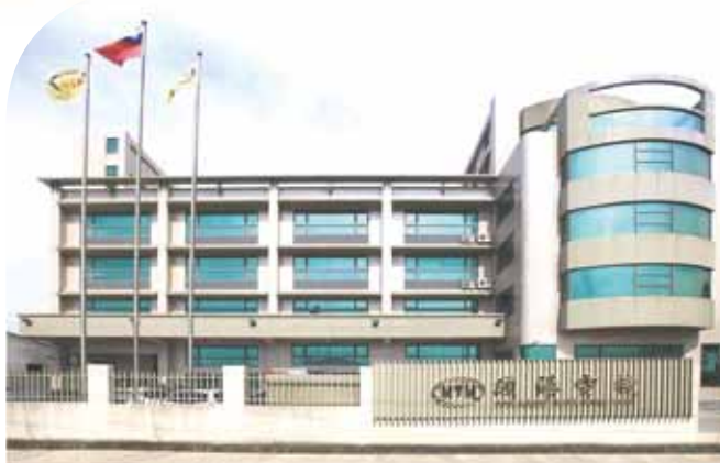
● 公司外觀 The profile of MTM