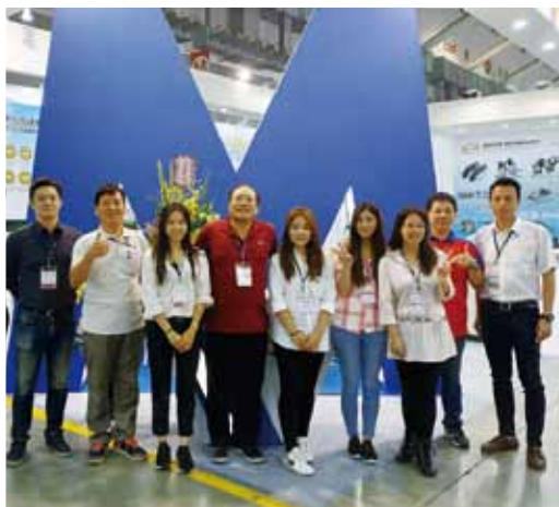
● 2018台北國際自動化工業展覽 2018 Taipei Int'l Industrial Automation Exhibition)