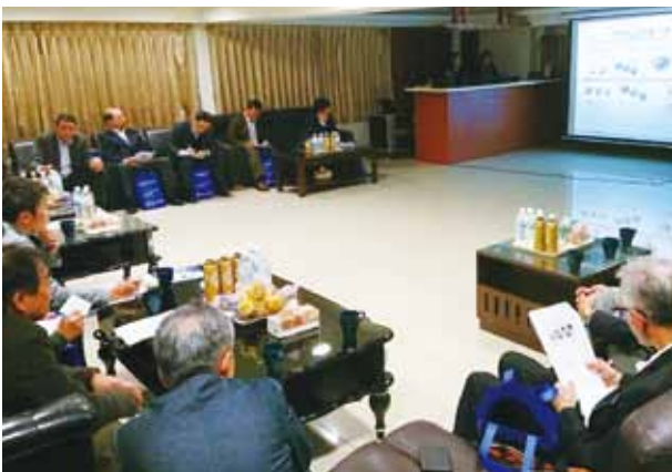
● 日本住友建機朝日公司參訪&會議 Sumitomo Corporation visited & meeting)