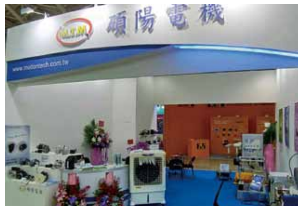
● 2017台北國際自動化工業展覽 2017 Taipei Int'l Industrial Automation Exhibition)