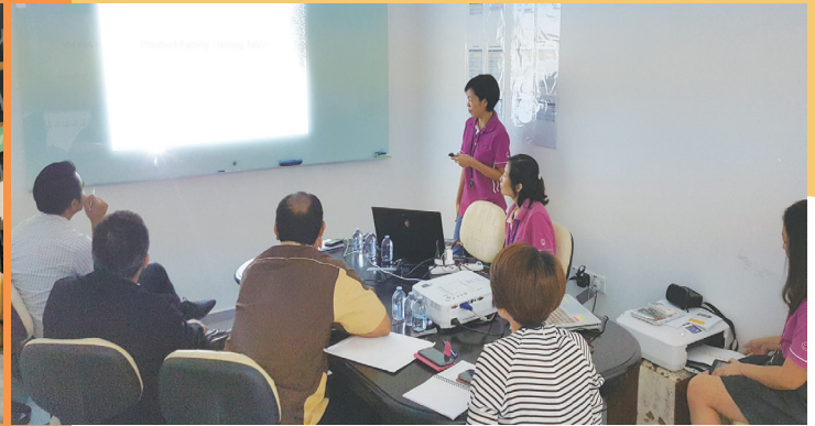
訓練-精益化管理程序 Lean Management

any kind of wood in creation of moving stories for furniture. We regularly organize woodworking classes in ArtSpace workshop that give those who are interested in furniture design and production opportunities to experience the simple and practical furniture making process and fun in daily life. We also let the participants have a deeper understanding in furniture manufacturing and increase people's awareness of forest conservation and the protection of nature.