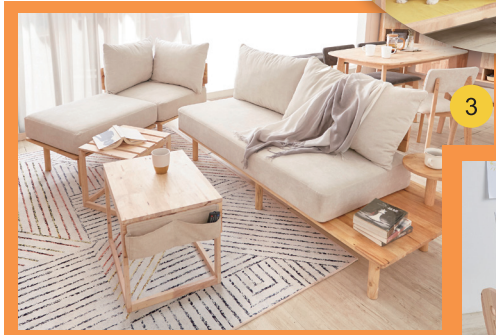
1.2.3.4. 產品 Product

As located in Muar, the "Furniture City of Malaysia", ArtSpace is burdened with important purpose – enhance the development of the local furniture industry and preserve the culture of the industry through the activities.