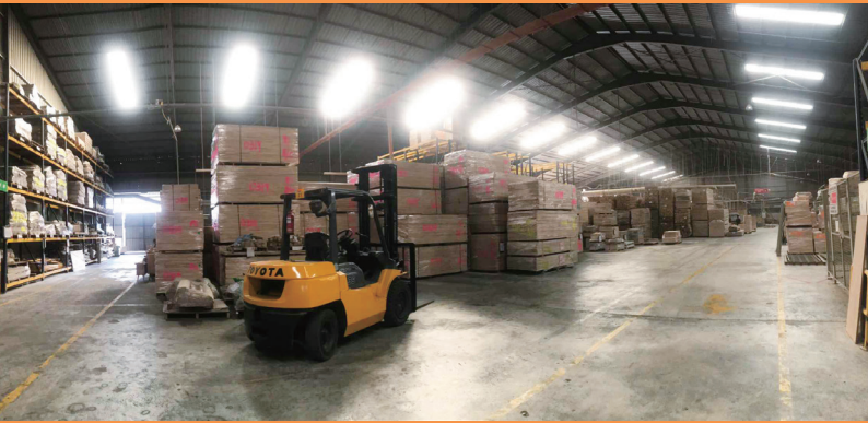
生產線 Production Line