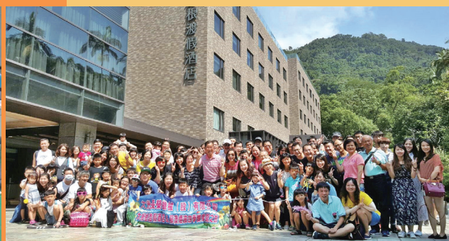
幸福企業-國內外員工旅遊 Happy enterprise - annually employee tour

PALMARY machines work well in more than 40 countries with the assistance of R&D members and experienced engineers who have grinding know-how background and specialize in mechanics & electronic control. We manufacture the grinders with “continuous innovation, high standard, and high quality” concepts and toward the upgraded humanized operation. This is how we make the difference between other competitors.