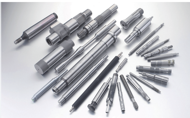
磨床產品研磨之工件 Workpiece sample ground by our grinders