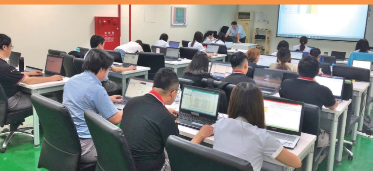
員工教育訓練 Employee training