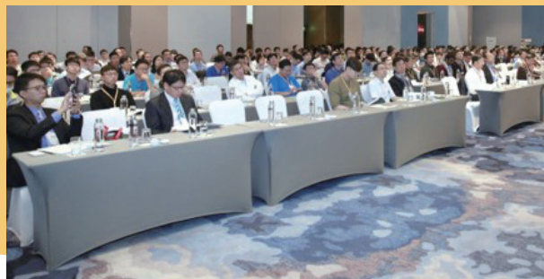
年度用戶大會盛況 Annual User Conference

number of product technology patents. Moreover, TADC has received endless gratitude and feedback due to the devotion to assisting in technical service and development of industry, government, and academia.