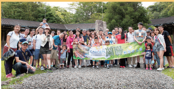
員工旅遊 Staff Travel