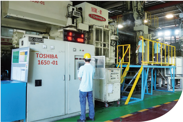
生產線作業-PLT1 1650T Product line

doing so will there be a chance for success. Special attention is also given towards the employees and subordinates in developing countries, aiding them to elevate their own capabilities.