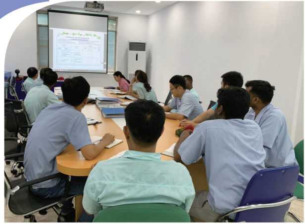
福利措施-員工教育 Employee Benefit -Training