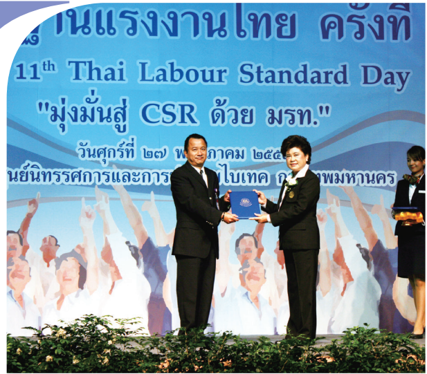
卓越事蹟 Excellent deeds

them. Integrating Taiwanese and Chinese manufacturing technologies and Thailand's simple and perceptual human-based management methods, while strictly demanding disciplines, it also gives employees sufficient care and solutions, laying the foundation for Apex's growth and creating a unique management culture.