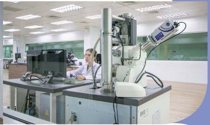
研發部門 R_D department

Apex Circuit (Thailand) Co., Ltd. (hereinafter referred to as Apex) was established in 2001. The main products of Apex are single-sided, double-sided, and multilayer printed circuit boards for consumer electronics and automobile audio used. In 2006, Apex invited an international management team and put a professional manager system in practice. After deeply cultivated in Thailand for nearly 2 decades, Apex has grown into the designated supplier of major international consumer electronics brand manufacturers.