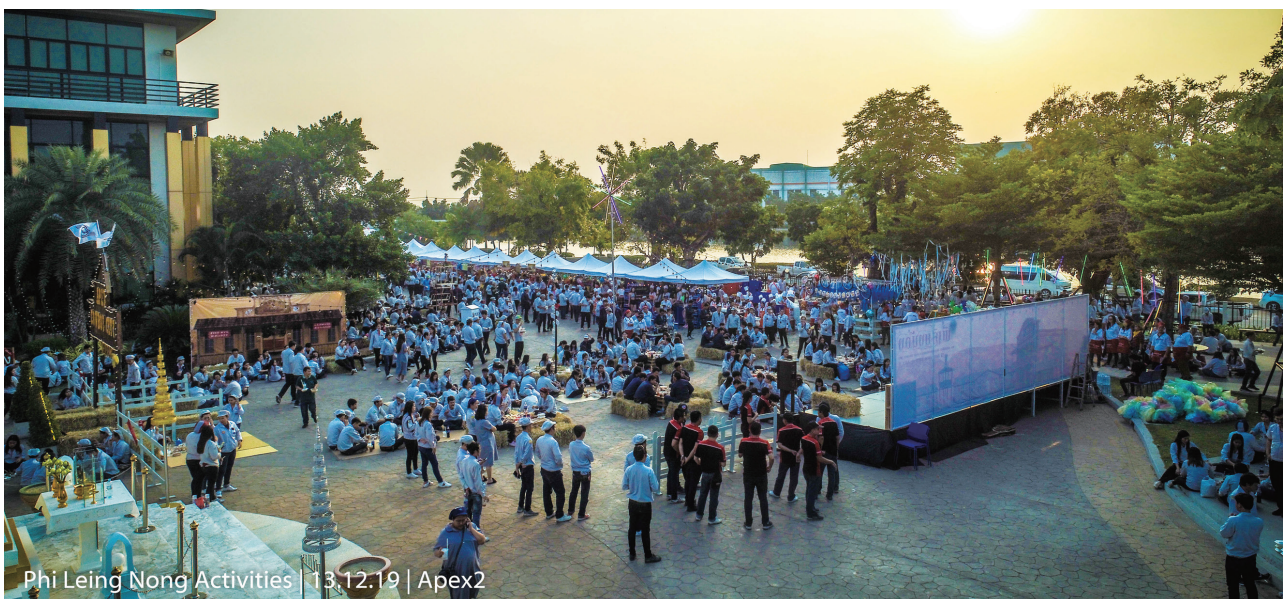
Phi Leing Nong Activities | 13.12.19 | Apex2

foundations and local monasteries. Apex initiatively takes care of the physical and mental needs of employees, making employees willing to contribute to society after work, forming a cycle of goodness. In terms of environmental protection measures, Apex aims to "reduce pollution, improve resource use efficiency, and become a sustainable enterprise." In addition to complying with relevant local environmental protection, safety, and health laws and regulations, and taking international standards as benchmarks, Apex has established clear key performance indicators for greenhouse gases, process waste, printed electronics, board waste, and wastewater to promote continuous improvement and jointly pursue a sustainable and beautiful society.