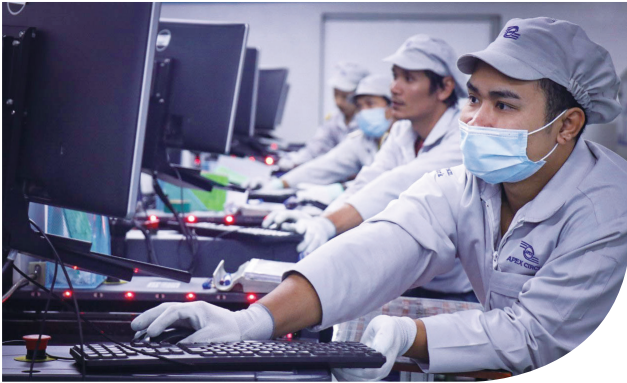
生產線作業情形-Production line operation situation