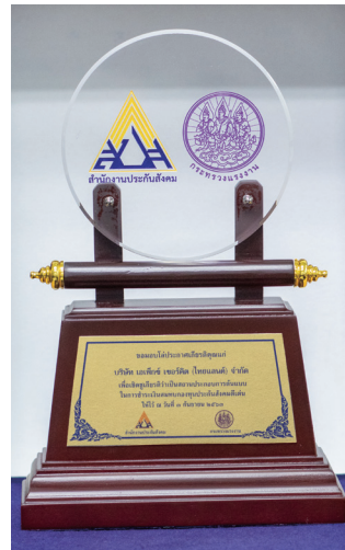
卓越事蹟 Excellent deeds

Apex在專業PCB製造本業中謀求卓越成就外，並積極善盡公益責任。Apex的社會回饋活動，包含慈善捐款、員工樂心捐血、提供盲人按摩工作機會、捐助生活用品予學校單位、醫療基金會及當地